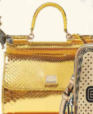
Gucci Gold-Tone Gucy Mini Shoulder Bag